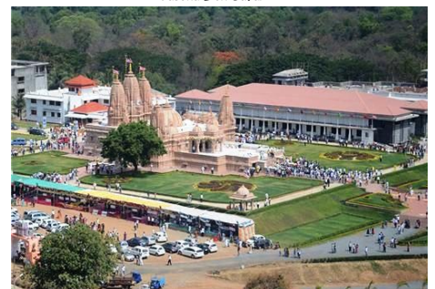
Swami Narayan Temple