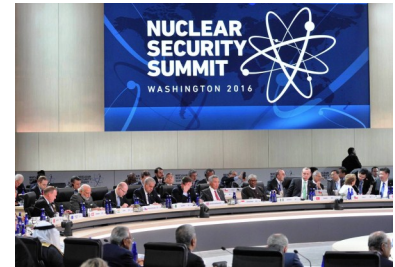
Prime Minister attends Nuclear Security Summit

Prime Minister Shri Narendra Modi visited USA on 31 st March and 1 st April, 2016 to participate in the 4 th Nuclear Security Summit in Washington. In his address on the theme "nuclear security threat perceptions", Prime Minister Modi said that the recent terror attacks in Brussels showed the real and immediate threat of terrorism to nuclear security. He called for focus on three contemporary features of terrorism viz., use of extreme violence by terrorism as a theatre, terrorists being tech-savvy and greater risk posed by state actors working with nuclear traffickers and terrorists.