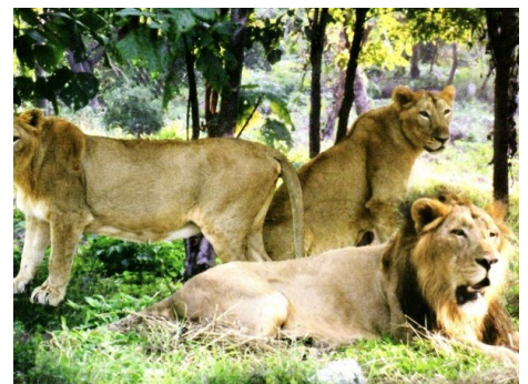
Vasona Lion Safari