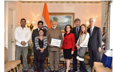
PM meets Indian Scientists of LIGO Project

He observed that while terror has evolved and terrorists are using 21 st century technology, the countries' responses are rooted in the past. He pointed out that terrorism is globally networked and its reach and supply chains are global, but the nation states still act nationally to counter the threat and genuine cooperation among them is not global. He urged everyone to drop the notion that terrorism is someone else's problem. He emphasized that nuclear security must remain an abiding national priority and all states must completely abide by their international obligations.