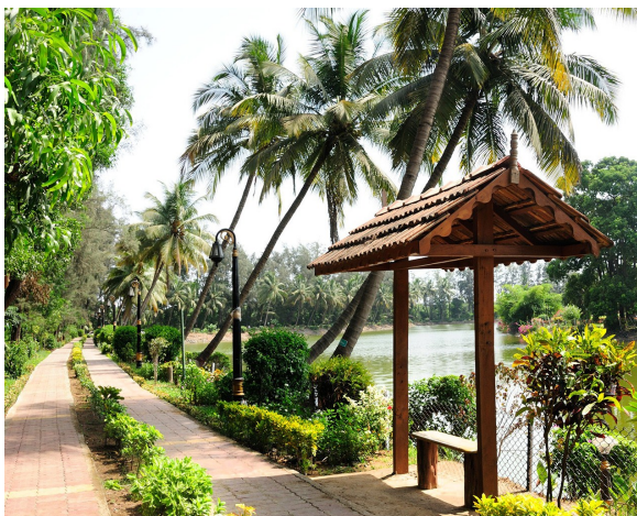
Vanganga Lake Garden